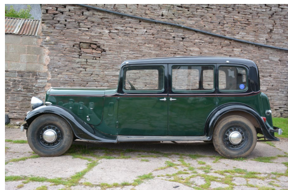
509 A An Austin 16/18 Clutch Plate and rivets.